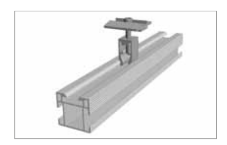
Module clamp with clickstone