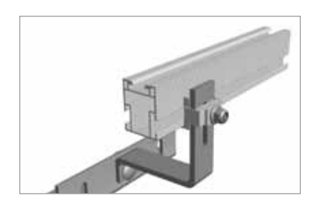
Roof hook with rail connection