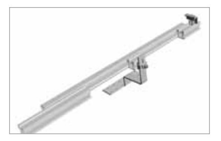
Telescoping end piece